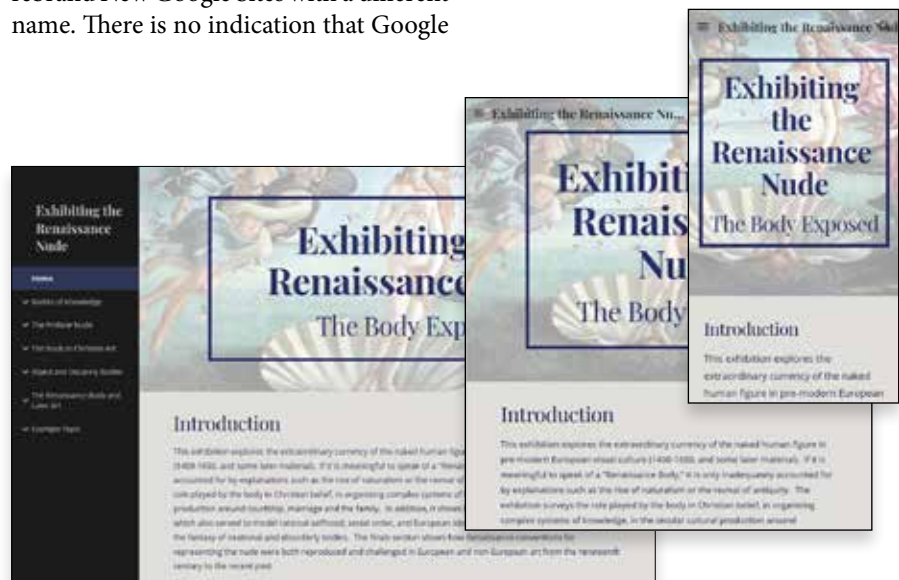
A Google Site displayed on a desktop, tablet, and smartphone.

It is recommended that students create a new account for class work instead of using their personal accounts. While this is an additional step, it ensures that they can keep their personal lives separated from their studies.