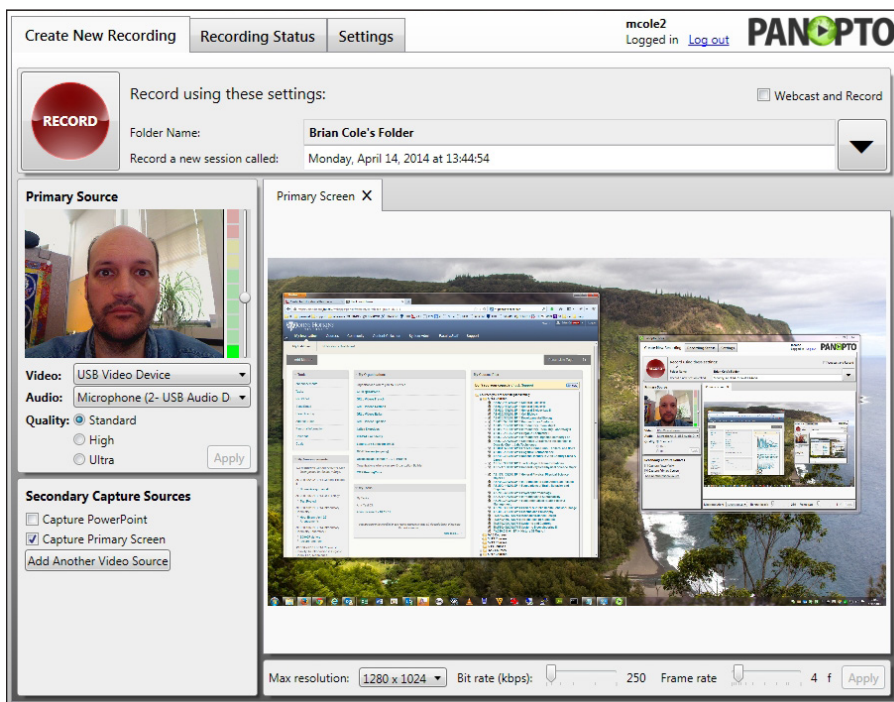
Screenshot of Panopto's recorder interface in Windows (Mac is similar)